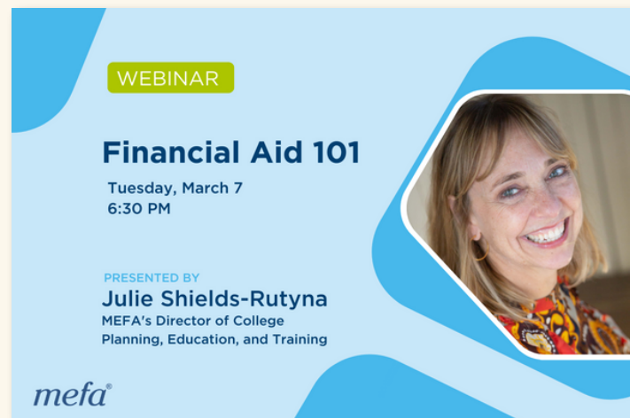
Community-Based Virtual and In-Person Events Informative and timely webinars and seminars