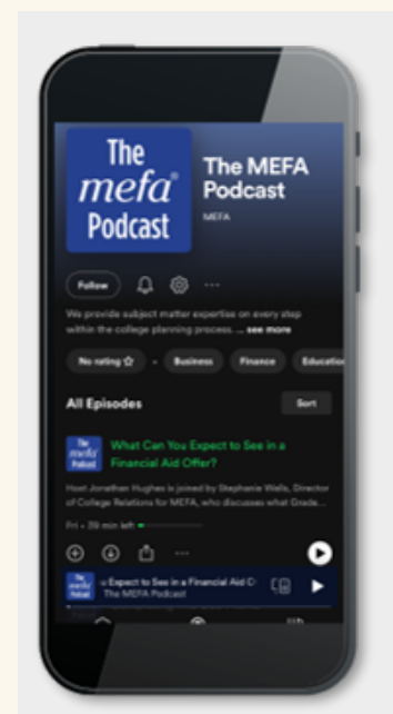
The MEFA Podcast Conversations with experts on a range of topics