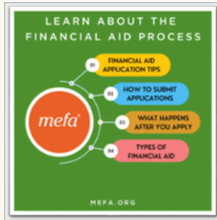
Active Social Media Network Posts on Facebook , Twitter , Instagram , and LinkedIn