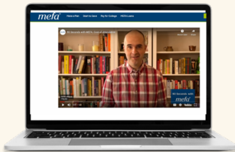
Videos An extensive video library on college planning